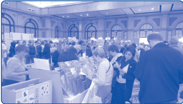
So much to choose from

Visit www.alexandrapalace.com for comprehensive information, road, rail and underground maps and a great deal more that will help make your day even more enjoyable.