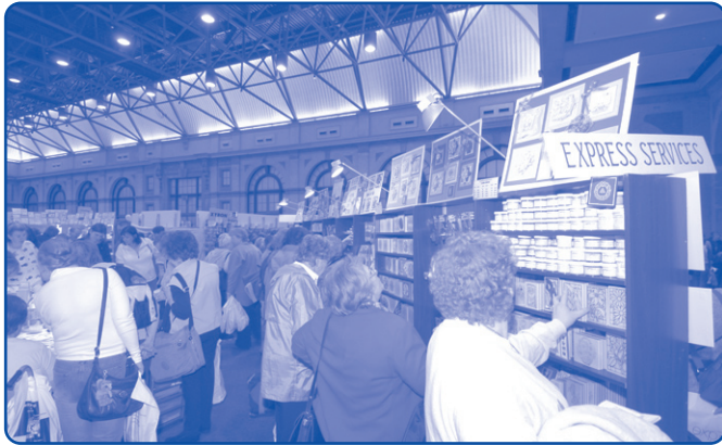
All the latest craft products on display

The Big Stamp & Scrapbooking Show is an unmissable opportunity for card-makers, rubber stampers and scrapbooking enthusiasts to see the latest products and materials displayed and demonstrated. There will be enough to satisfy everyone from the beginner to the most capable crafter with a whole host of things to see and do for all sorts of craft projects. Besides the superb displays and the latest products to see and purchase there will be free demonstrations on both days and there is a great deal of added