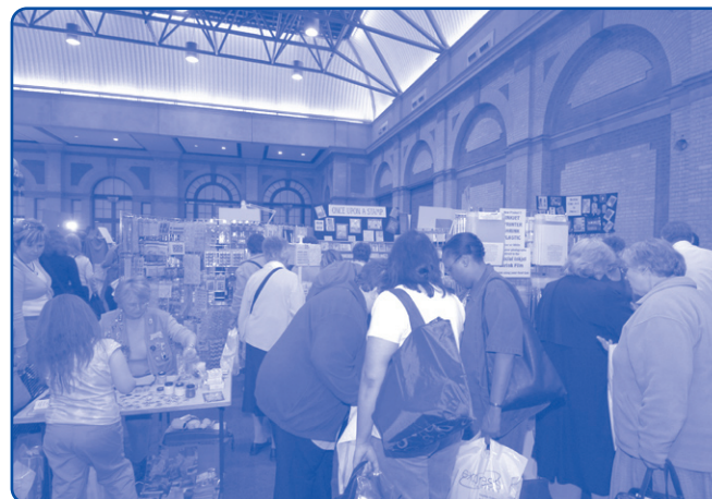
No matter what a crafter might want, it's probably here

For those that prefer the comfort and convenience of coach travel, various coach companies organise trips to the show (see opposite page). Should public transport be more convenient, buses pass regularly and for those travelling by rail or underground the stations are just a short distance away and there's free transport to and from the local stations. There is easy access for the disabled and wheelchair users with concessions for senior citizens and children.