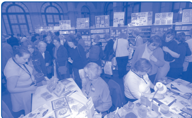
Demonstrations show how easy it can be

The Big Stamp & Scrapbooking Show is an unmissable opportunity for card-makers, rubber stampers and scrapbooking enthusiasts to see the latest products and materials displayed and demonstrated. There will be enough to satisfy everyone from the beginner to the most capable crafter with a whole host of things to see and do for all sorts of craft projects. Besides the superb displays and the latest products to see and purchase there will be free demonstrations on both days and there is a great deal of added